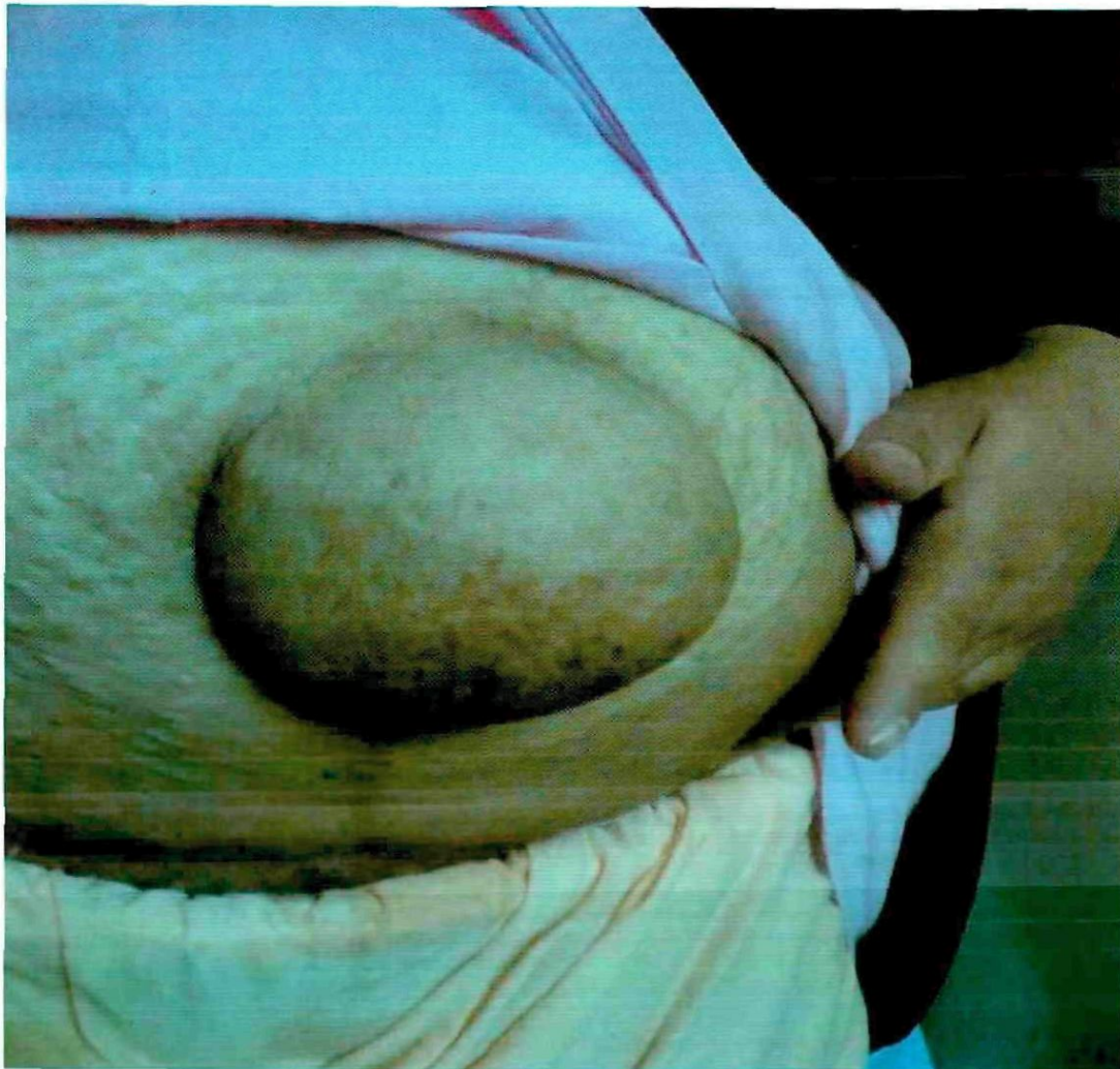
Fig. 1.: Paraumbilical hernia during pregnancy