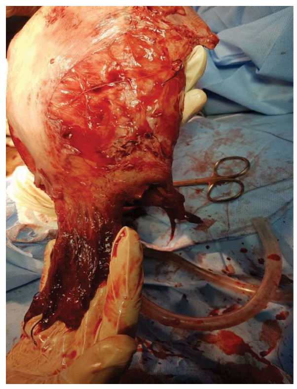
Figure 4: Total hysterectomy specimen in women with unscarred uterus showing lateral tear extending from cervix upwards